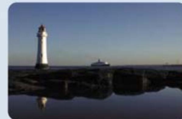
2 New brighton lighthouse