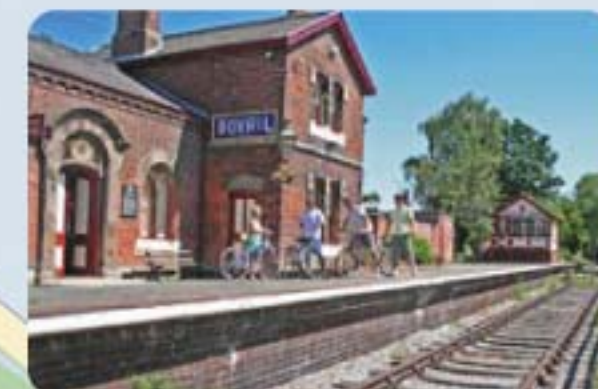
4 Hadlow train station