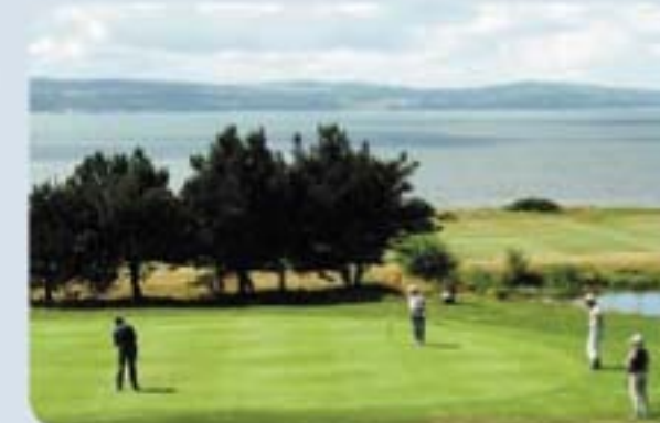
3 Royal Hoylake Golf Course, home of the Open