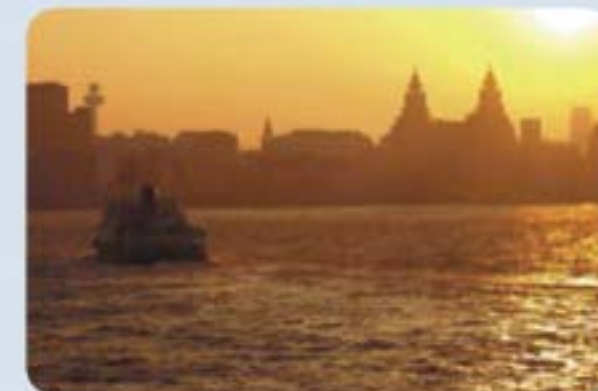
1 The wonderful view of Liverpool waterfront.

Most but not all of Route 56 is traffic free.